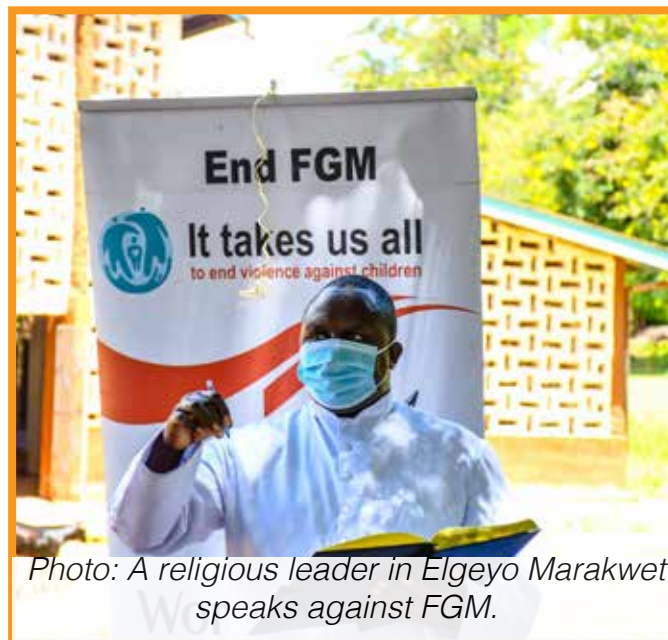
Photo: A religious leader in Elgeyo Marakwet speaks against FGM.

A team from the UNFPA Kenya Country Office re-