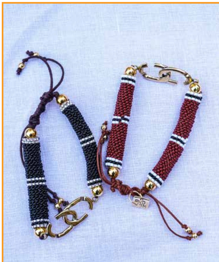
Photo: The Johari bracelets produced through the Ushanga Initiative geared towards the economic empowerment of women

UNFPA Kenya is seeking partnership with a Japanese company Panasonic, to provide Solar Lanterns to the women which will ease their work and provide much needed light to their homesteads.