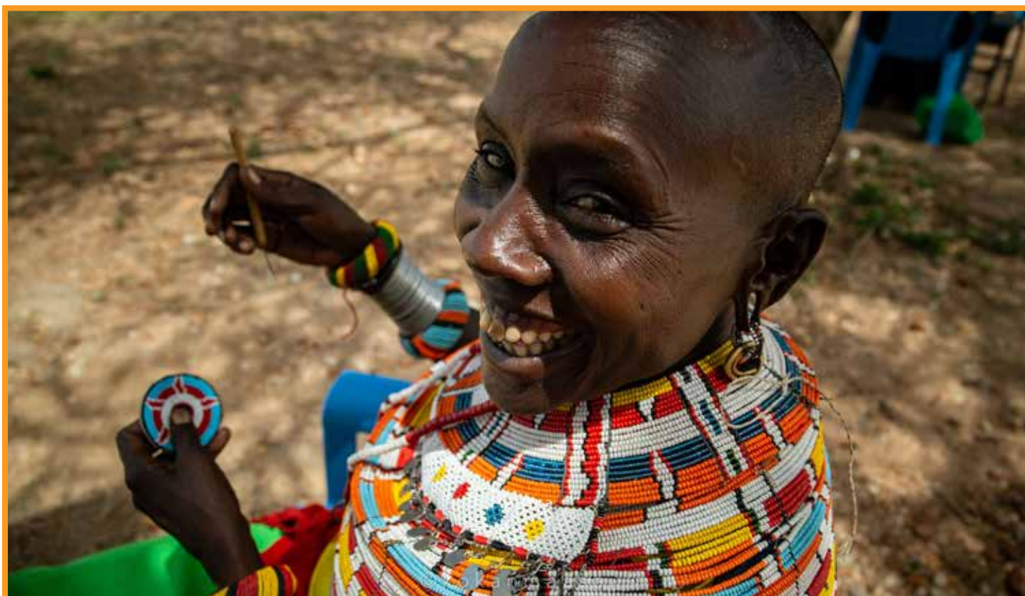
Photo: A woman from the Maasai community showcases her beads