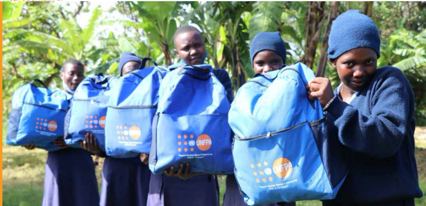
Photo: Adolescent girls in Meru County with dignity kits provided by UNFPA Kenya