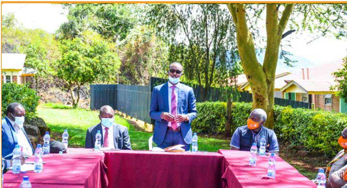
Photo: Speaker of the Elgeyo Marakwet County Assembly, Hon. Philemon Sabulei, makes remarks during a UNFPA field mission to the County.