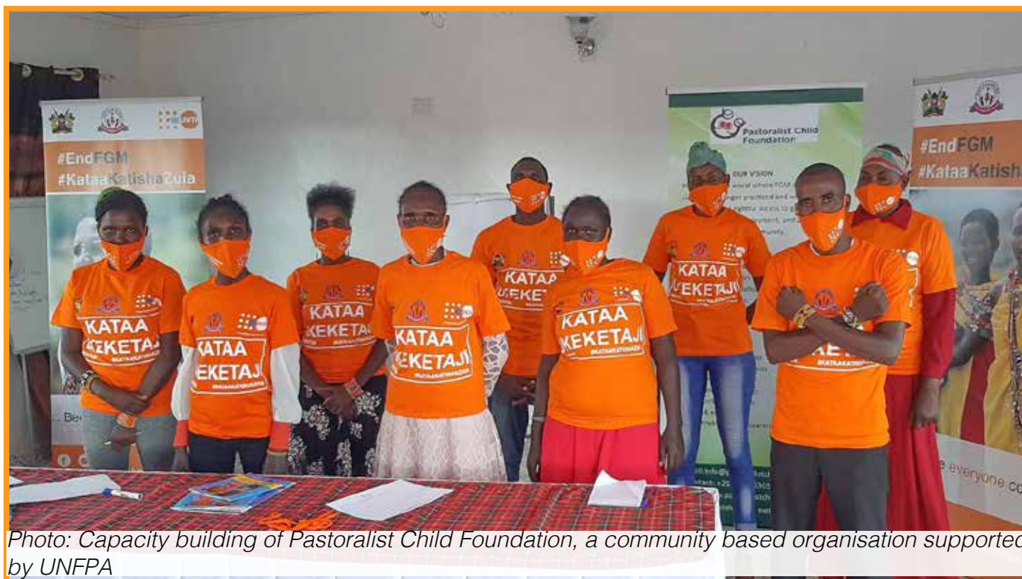
Photo: Capacity building of Pastoralist Child Foundation, a community based organisation supported by UNFPA

Grassroot organizations play a key role in management on issues of FGM.