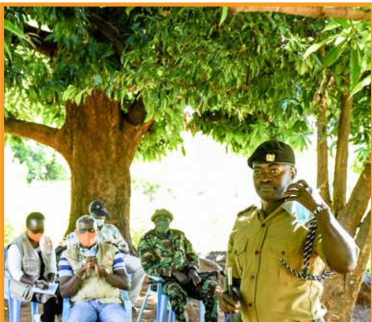
Photo: Engagement of security forces in Elgeyo Marakwet County to accelerate the abandonment of FGM in the region.

The County Government of Elgeyo Marakwet has made progress in drafting a County Anti-FGM Bill which once adopted