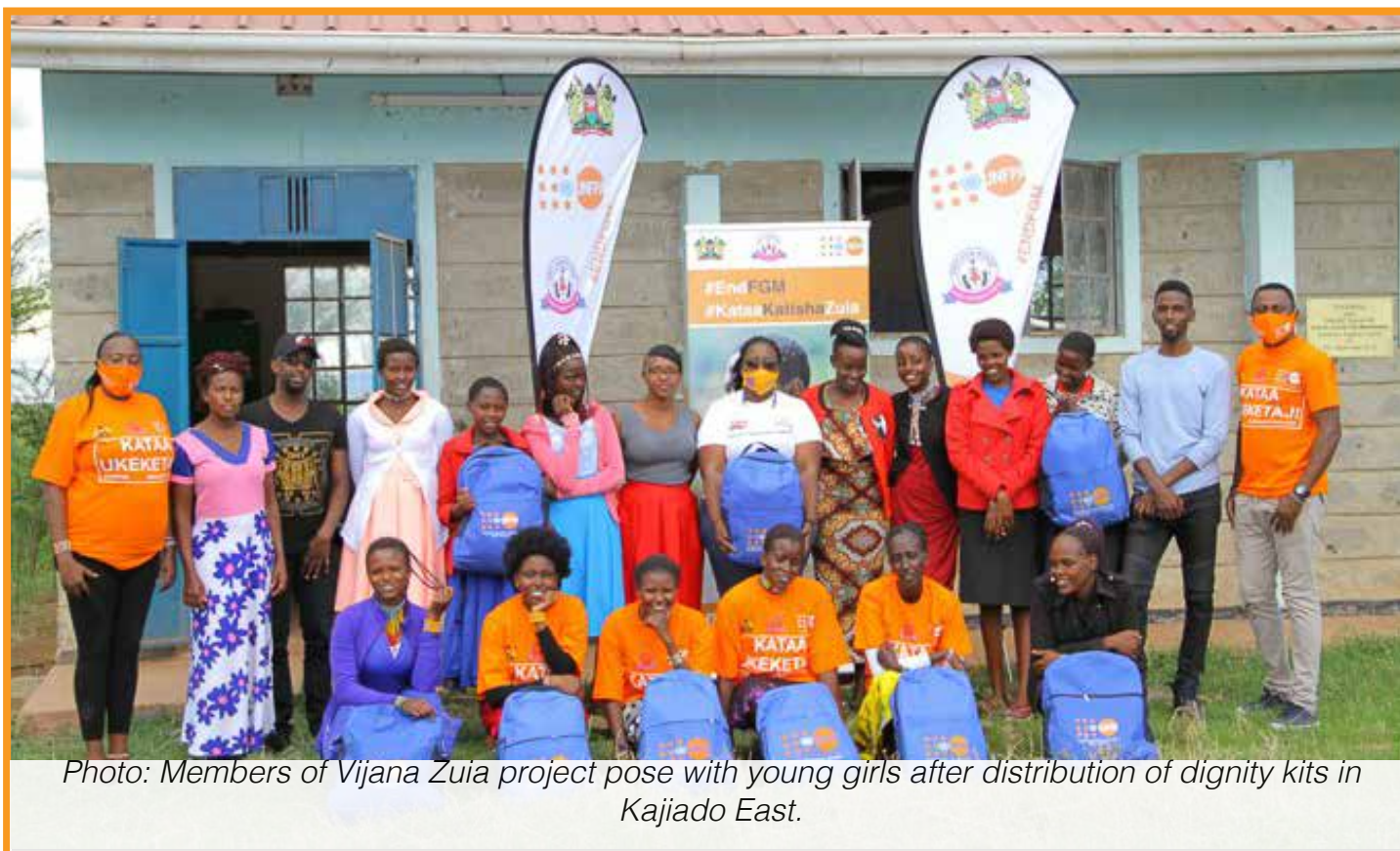
Photo: Members of Vijana Zuia project pose with young girls after distribution of dignity kits in Kajiado East.