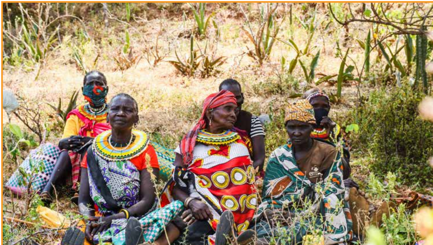
Photo: Women in West Pokot County listen to proceedings of the elders making a declaration to abandon FGM in their community during the International Day of Zero Tolerance of FGM.