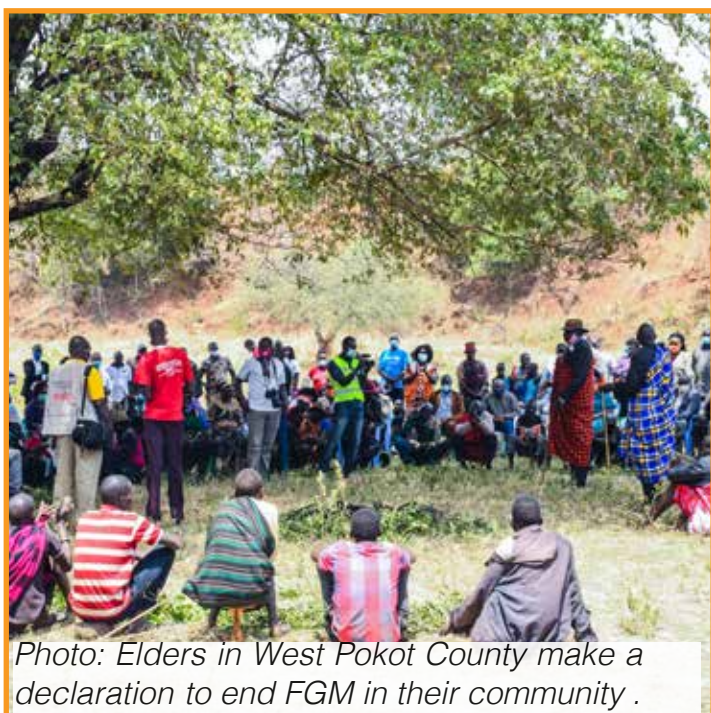
Photo: Elders in West Pokot County make a declaration to end FGM in their community .